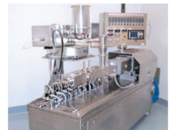
27 mm Leistritz extruder

Learn more about how Lonza's hot-melt extrusion technology can address your bioavailability challenges.