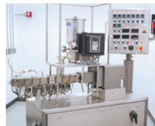
18 mm Leistritz extruder