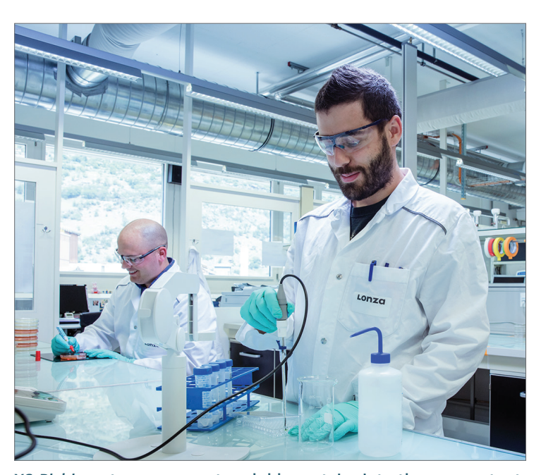
XS Pichia system can secrete soluble proteins into the supernatant. As a result, the produced protein is highly pure. No endotoxins are formed with Pichia and there is no need for viral clearance.

The use of methanol at commercial scale will require explosion-proof facilities which is a significant cost investment. Also, the toxicity of methanol and its metabolites reduces the cell viability and therefore negatively impacts the product quality in terms of product and/or host cell-related impurities. Constitutive promoters can eliminate some of these problems, but the titers in general are not as high as with